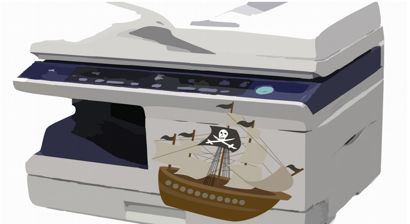
Image remixed by Horst JENS. Image sources: pixabay / cc0 Public domain

first posted at 2015-12-19 at torrentfreak.com [1]