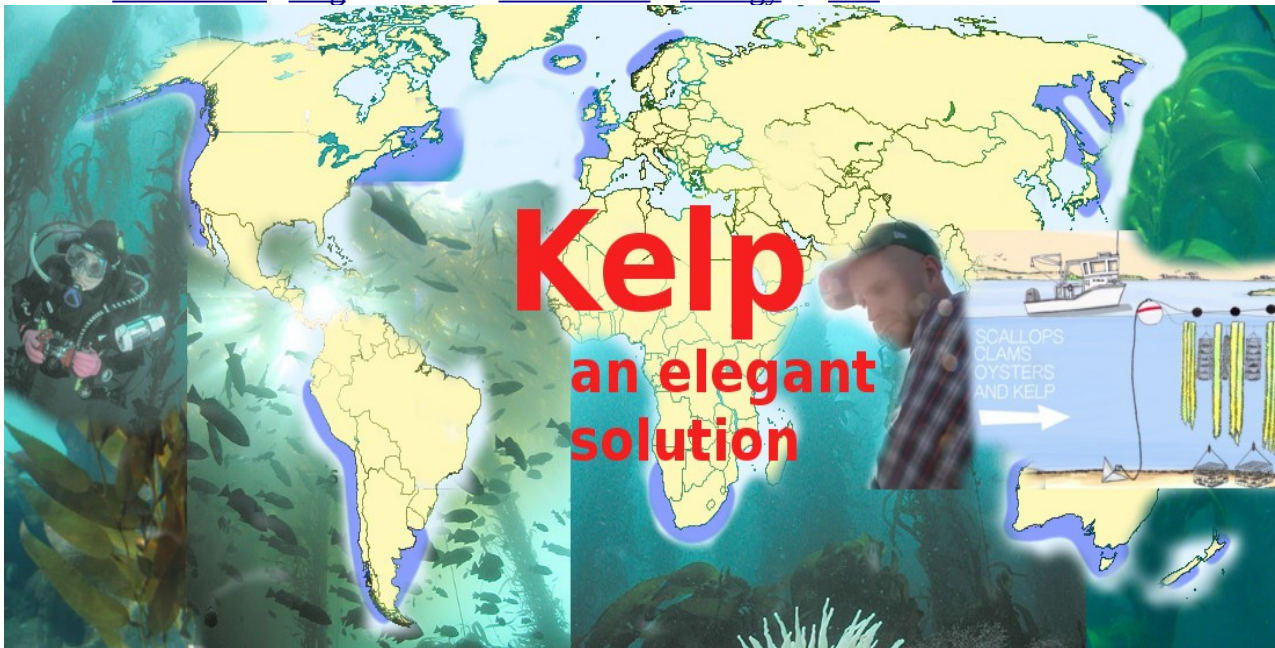
See imagesources.txt [6] for details This article was first published 2016-03-25 at medium.com [7].