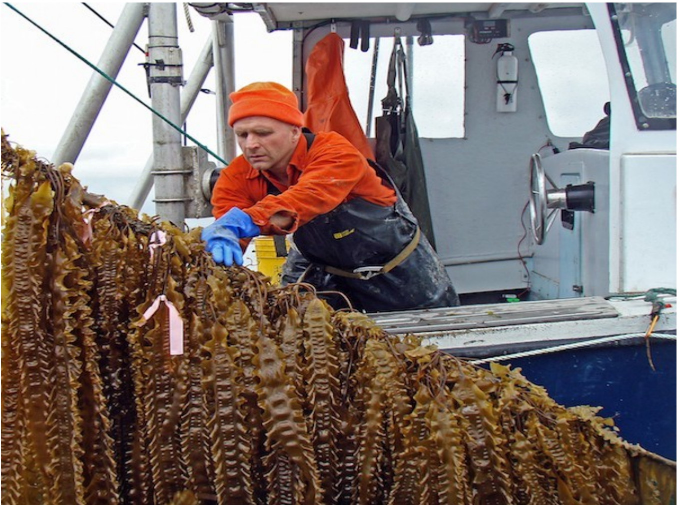
Kelp harvest.