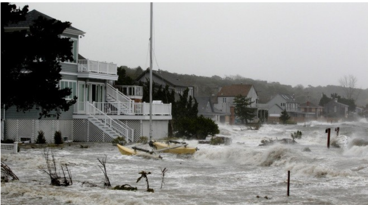
Hurricane.

So I kept searching and ended up on Long Island Sound, where there was a program to attract young fishermen back into the industry by opening up shell-fishing grounds for the first time in 150 years. I signed up, leased some grounds from the state of New York, and re-made myself as an oysterman. I did this for seven years. Then the storms hit. Hurricane Irene and Hurricane Sandy thrashed the East Coast. Two years in a row the storms buried 90 percent of my crops in three feet of mud, and 40 percent of my gear was washed away in a sea of death. At the same time, lobster were being driven northward by warming waters, and acidification was increasing faster than at any other time in 300 million years, killing billions of oyster seed up and down the American coast.